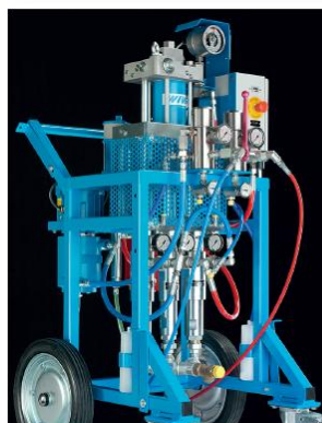
WIWA POWERPACK 2K-XXL hydraulic systems