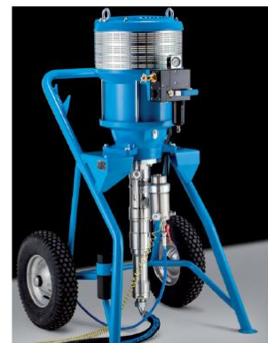
WIWA Airless 270