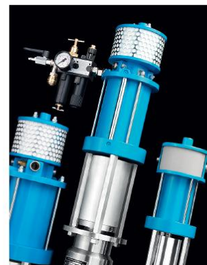
WIWA material feed pumps for almost every application field