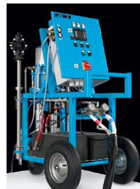
WIWA PU 460 polyurea systems