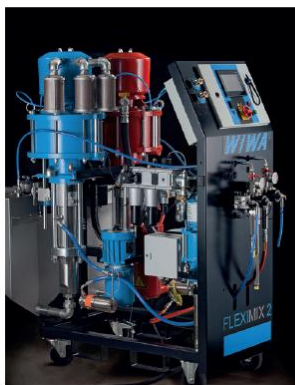
WIWA FLEXIMIX, electronic 2K painting and coating systems