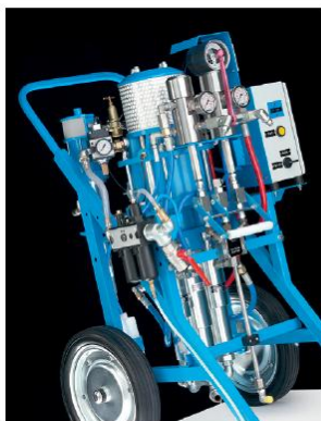
WIWA DUOMIX 2K airless paint spraying systems